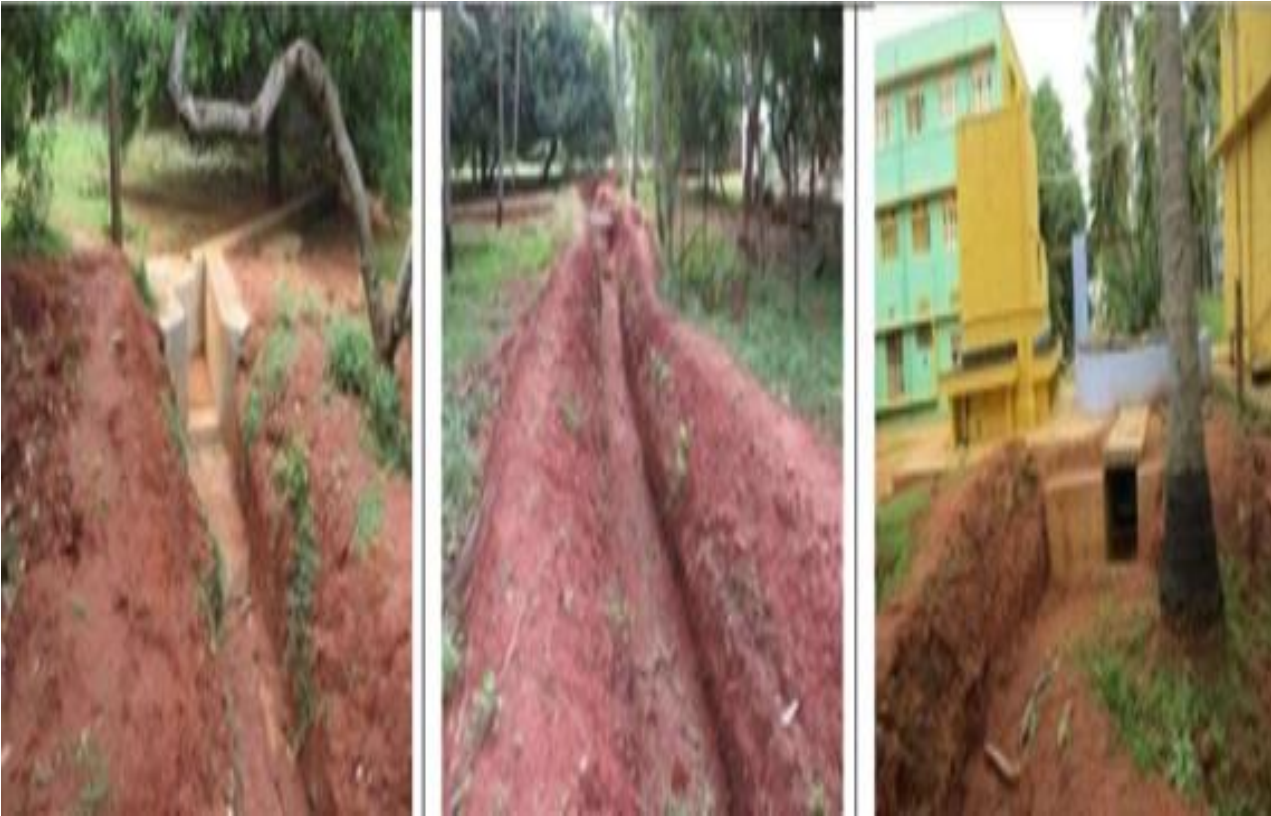
ESRD WATER CHANNELISED FOR IRRIGATING LAWNS 1965