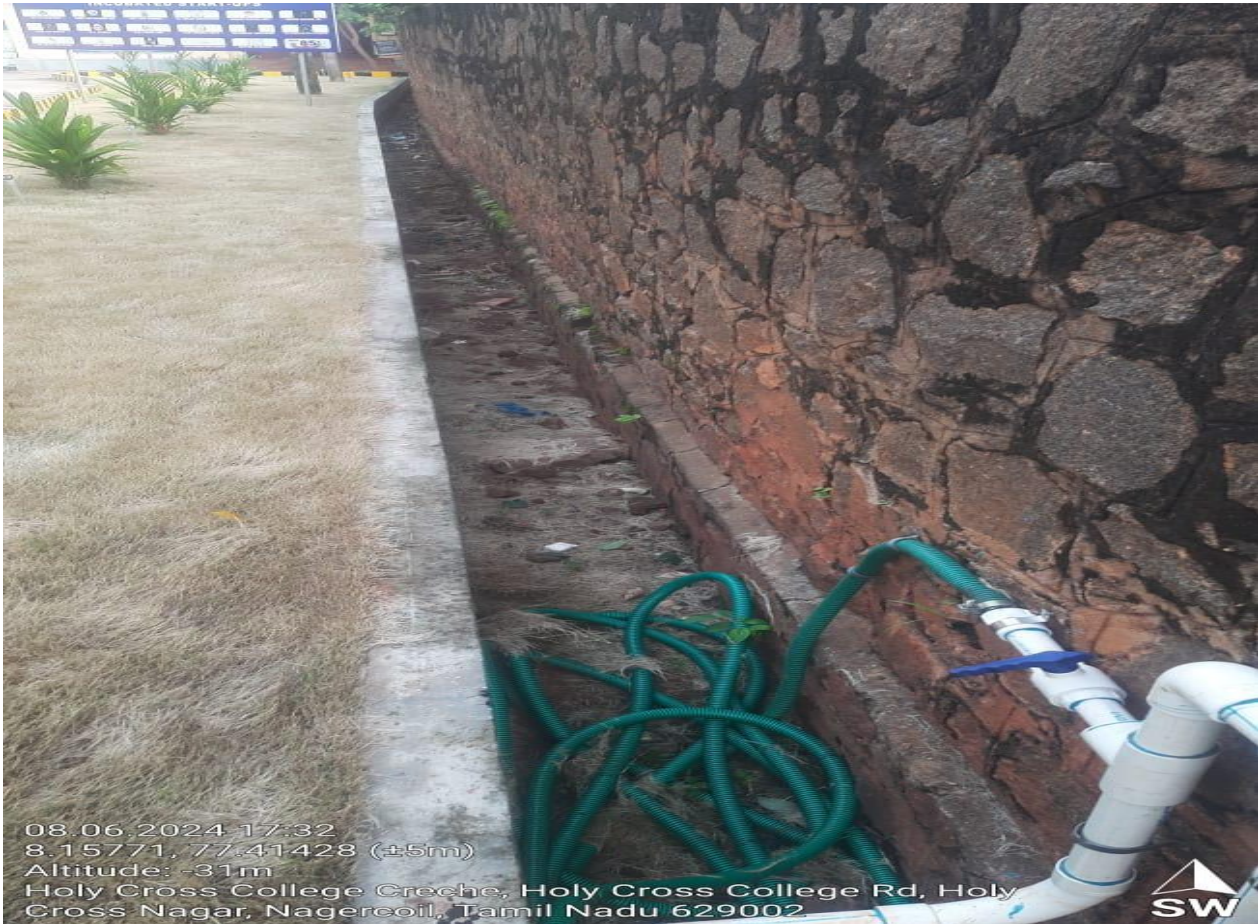
08.06.2024 17:32 8.15771, 77.41428 (±5m) Altitude: -31m Holy Cross College Creche, Holy Cross College Rd, Holy Cross Nagar, Nagercoil, Tamil Nadu 629002