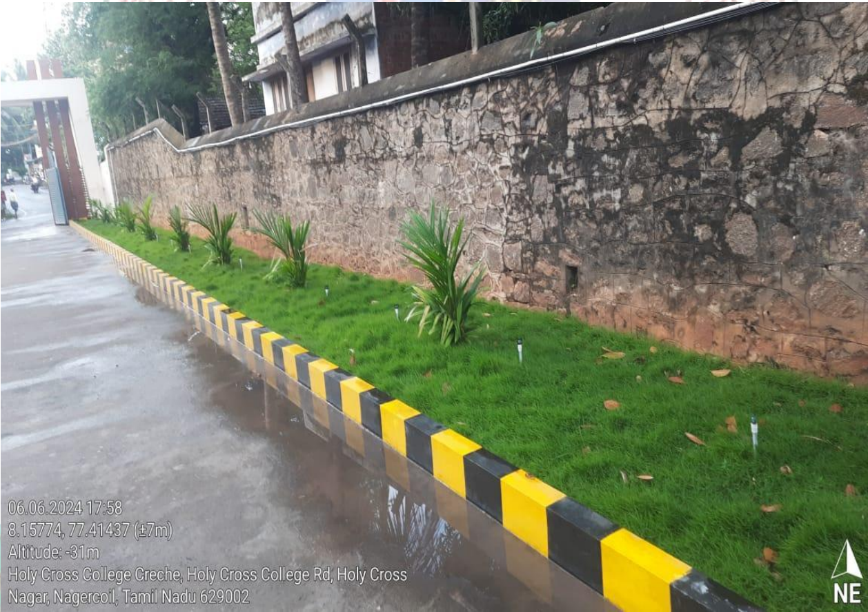
06.06.2024 17:58 8.15774, 77.41437 (±7m) Altitude: -31m Holy Cross College Creche, Holy Cross College Rd, Holy Cross Nagar, Nagercoil, Tamil Nadu 629002