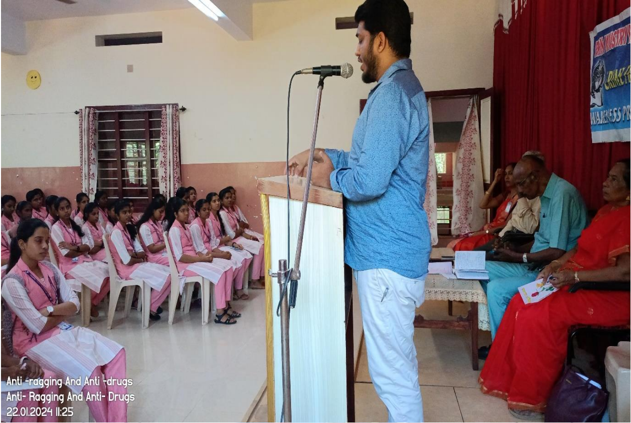
Anti -ragging And Anti -drugs Anti- Ragging And Anti- Drugs 22.01.2024 11:25