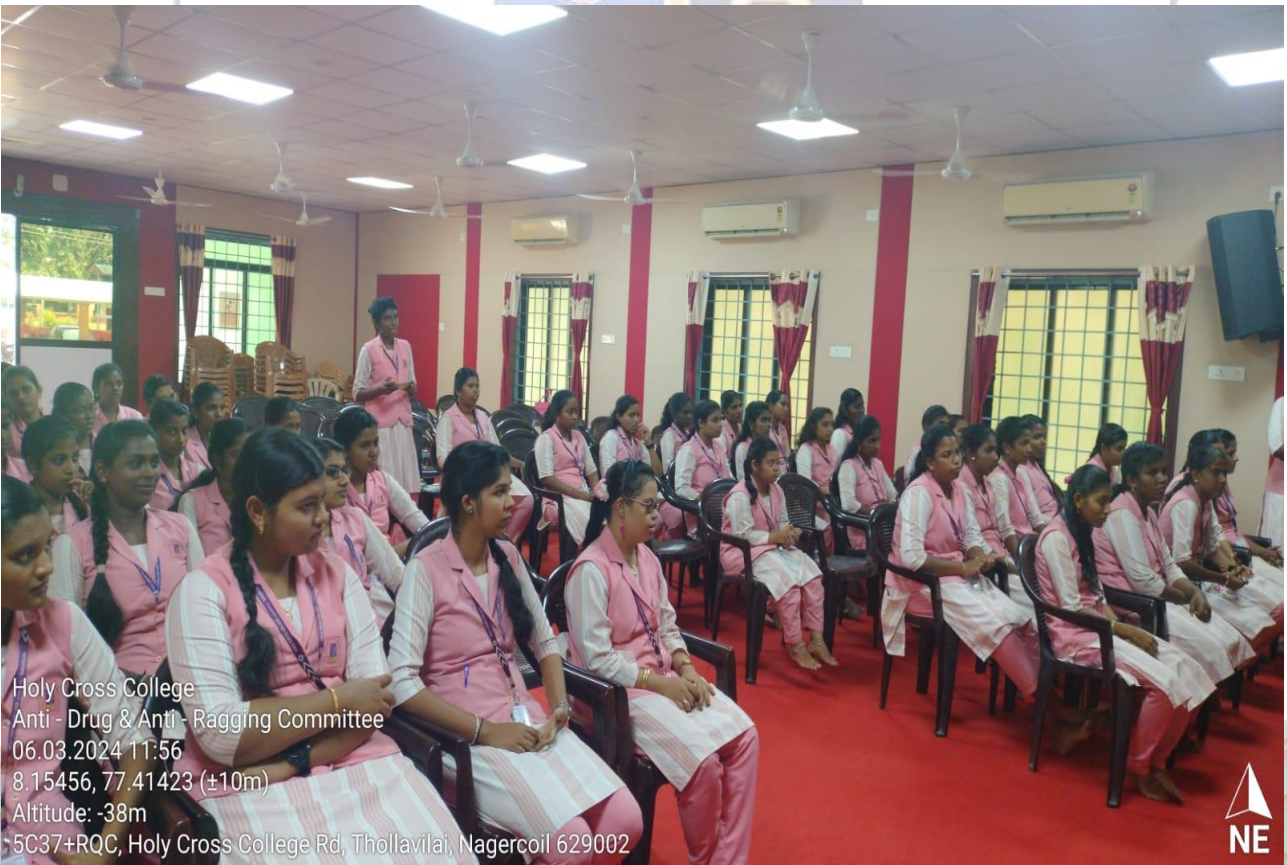
Holy Cross College Anti - Drug & Anti - Ragging Committee 06.03.2024 11:56 8.15456, 77.41423 (±10m) Altitude: -38m 5C37+RQC, Holy Cross College Rd, Thollavilai, Nagercoil 629002