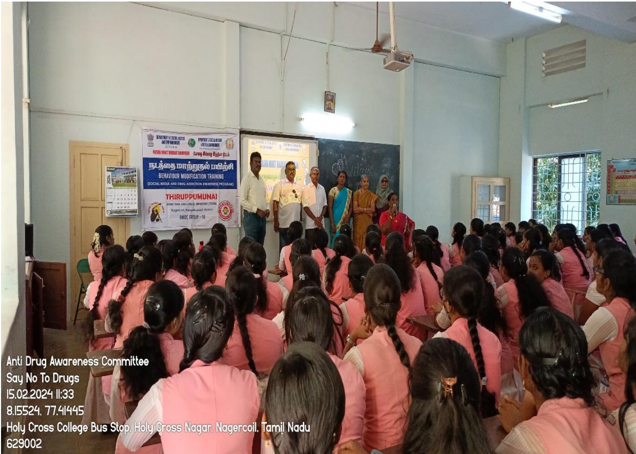
Anti Drug Awareness Committee Say No To Drugs 15.02.2024 11:33 8.15524, 77.41445 Holy Cross College Bus Stop, Holy Cross Nagar, Nagercoil, Tamil Nadu 629002