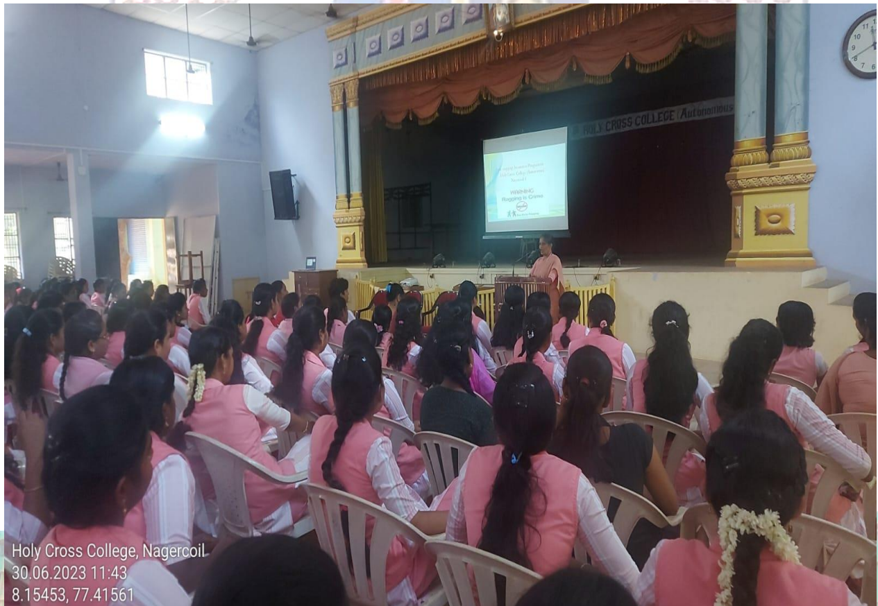
Holy Cross College, Nagercoil. 30.06.2023 11:43 8.15453, 77.41561