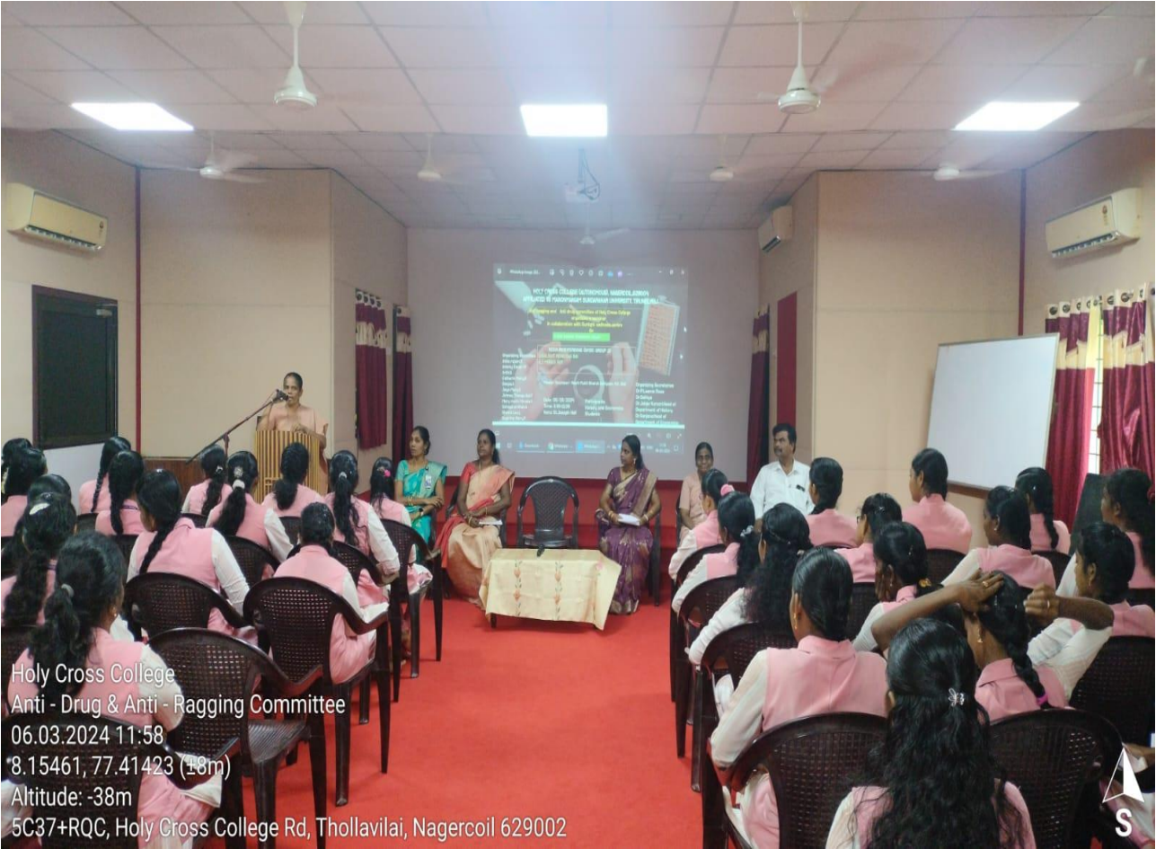
Holy Cross College Anti - Drug & Anti - Ragging Committee 06.03.2024 11:58 8.15461, 77.41423 (±8m) Altitude: -38m 5C37+RQC, Holy Cross College Rd, Thollavilai, Nagercoil 629002