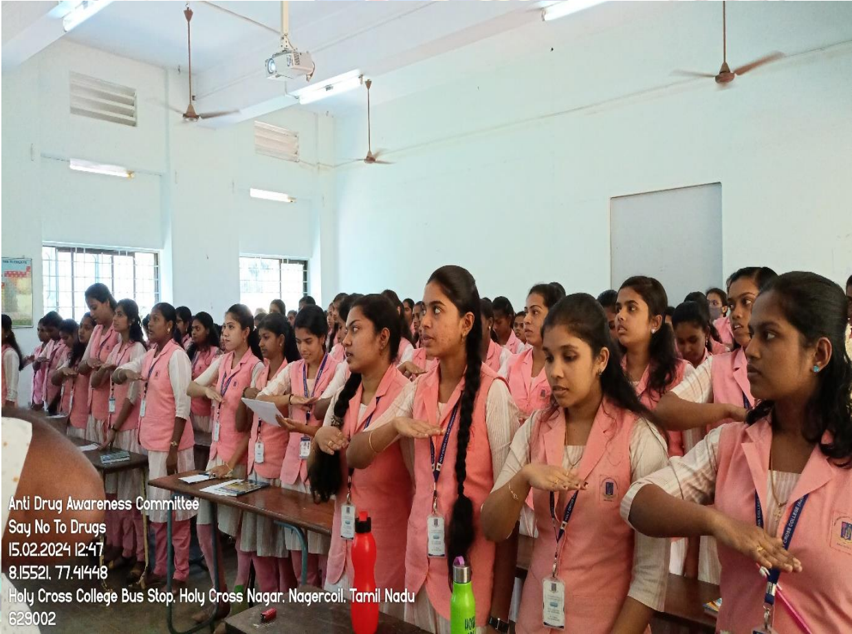
Anti Drug Awareness Committee Say No To Drugs 15.02.2024 12:47 8.15521, 77.41448 Holy Cross College Bus Stop, Holy Cross Nagar, Nagercoil, Tamil Nadu 629002