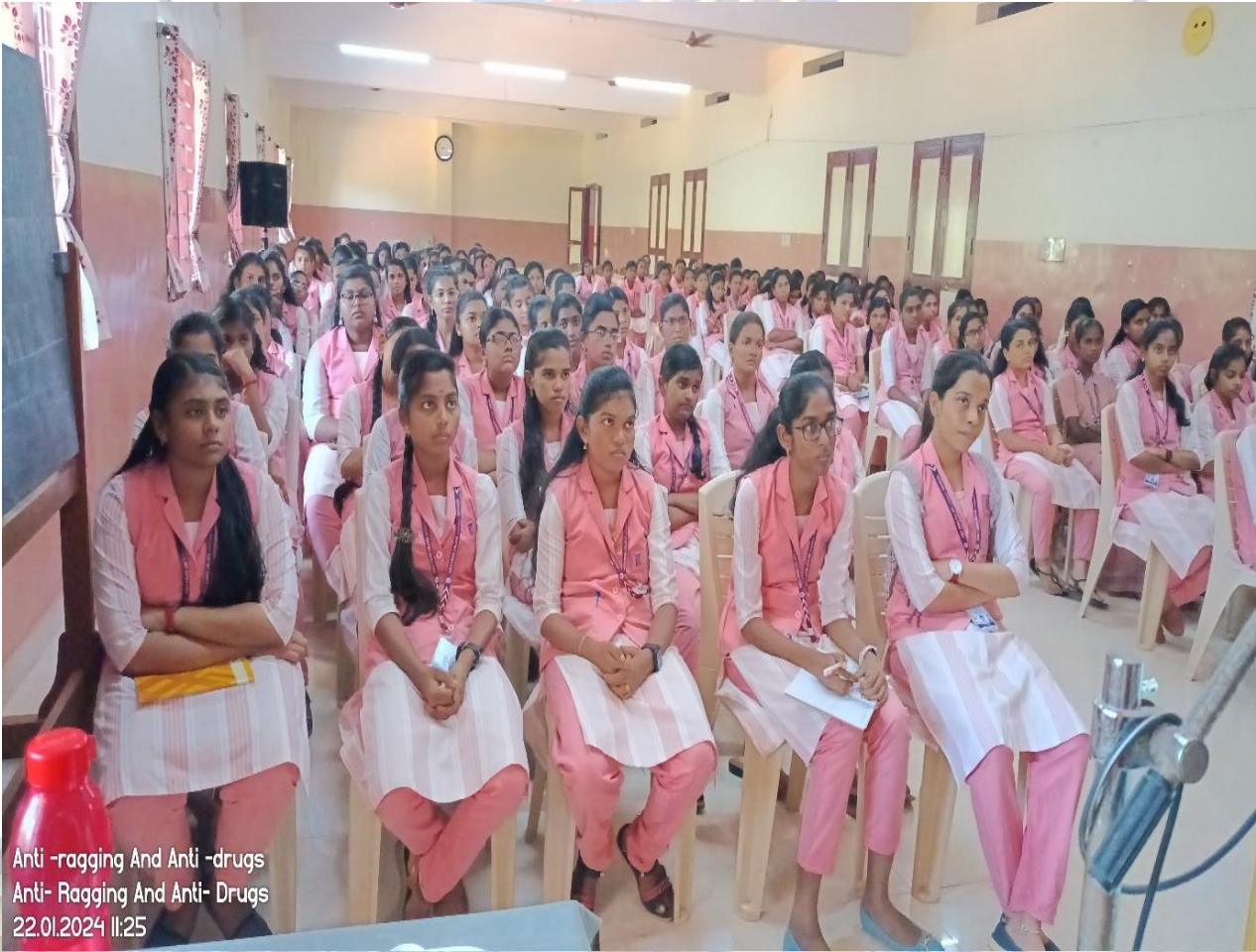
Anti -ragging And Anti -drugs Anti- Ragging And Anti- Drugs 22.01.2024 11:25