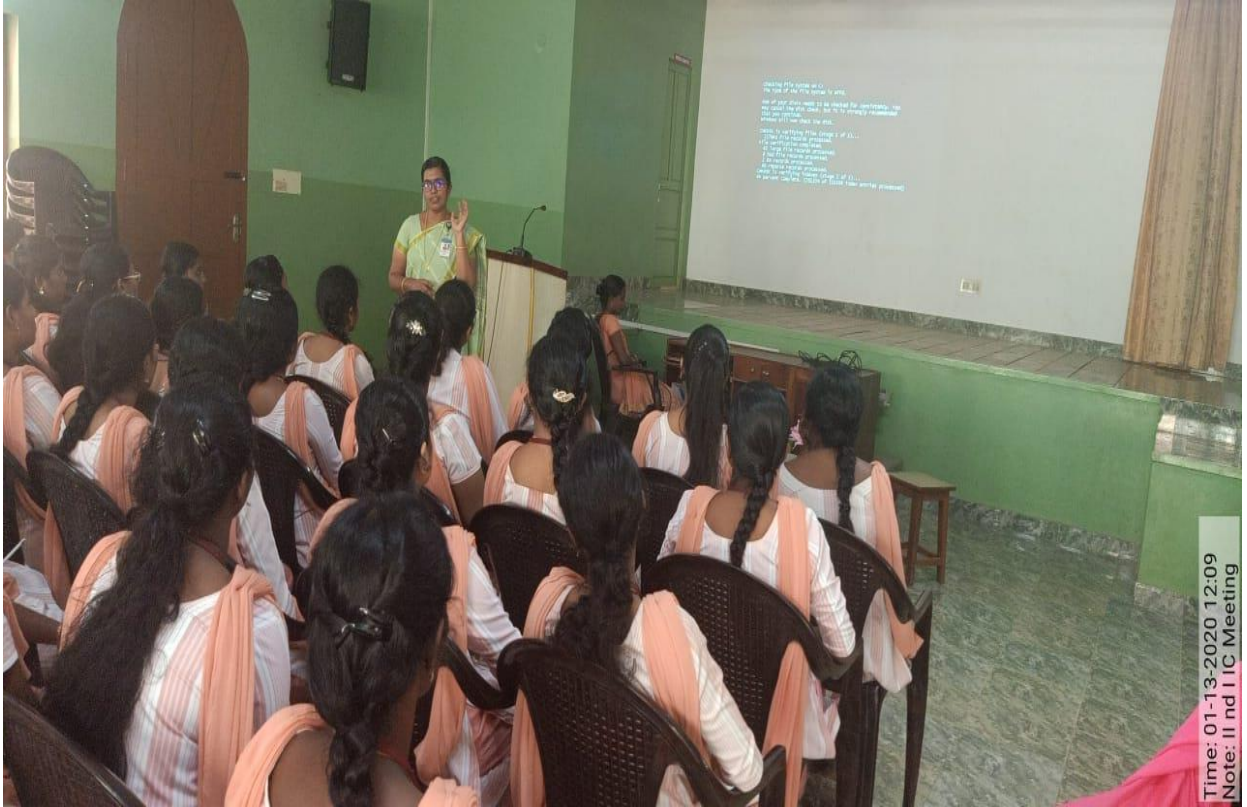
Orientation on Smart India Hackathon 2020