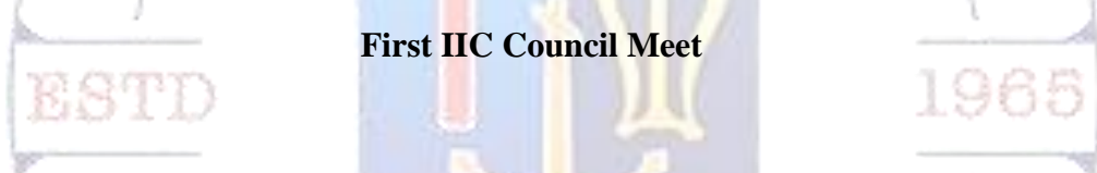
First IIC Council Meet