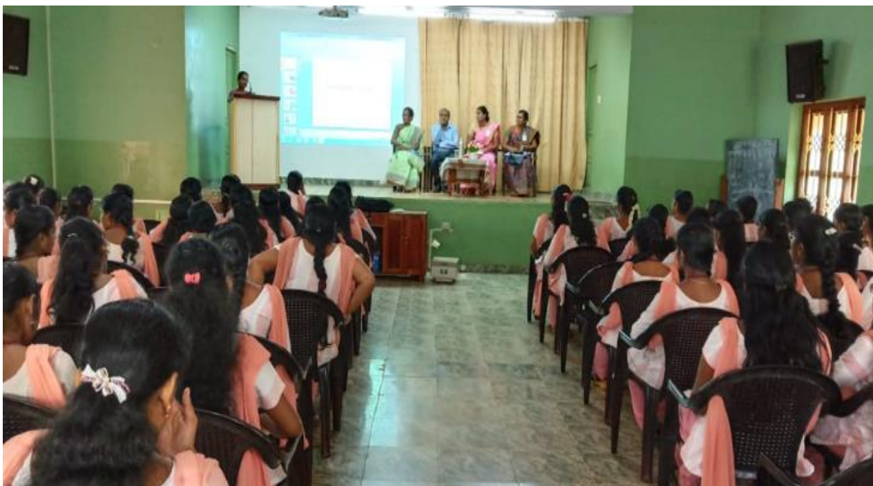
My story – Innovator’s Life & Cross Road Motivational Speech