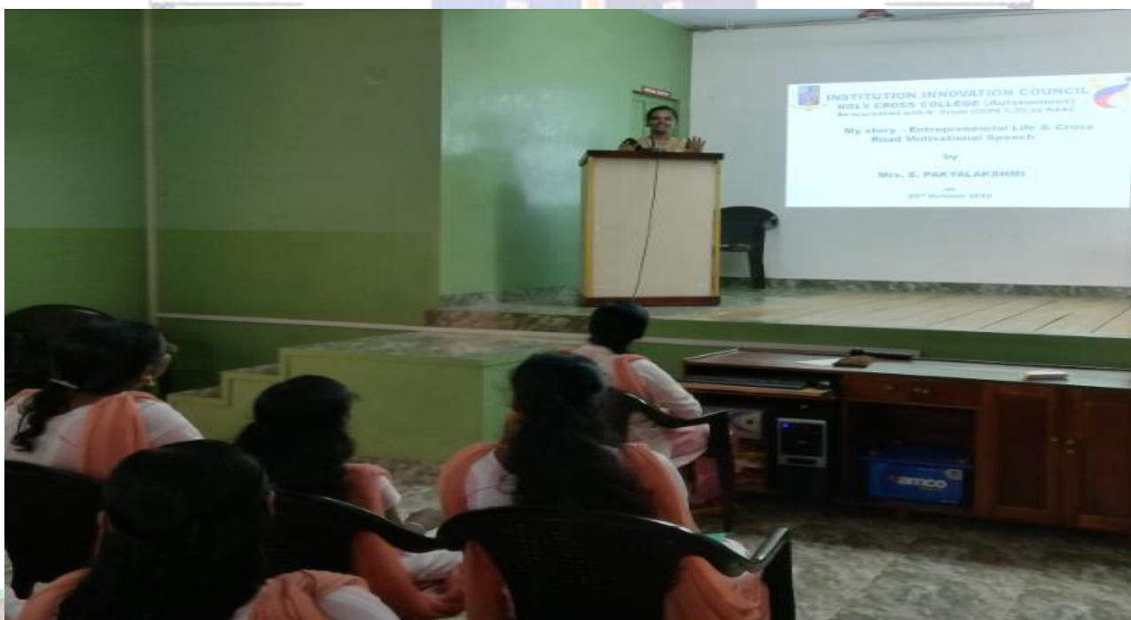
My story – Entrepreneurial Life & Cross Road Motivational Speech