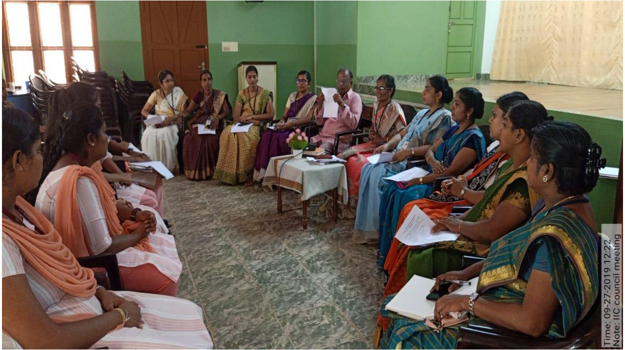
Time: 09-27-2019 12:22 Note: IIC council meeting