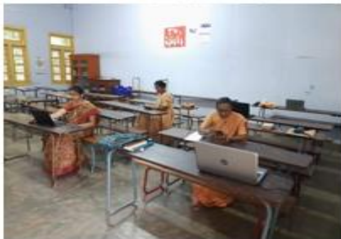
FDP on Channelizing Innovation and Entrepreneurship through ICT Tools