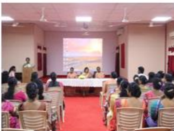
Two days' State Level Technical Workshop on Intellectual Property Rights